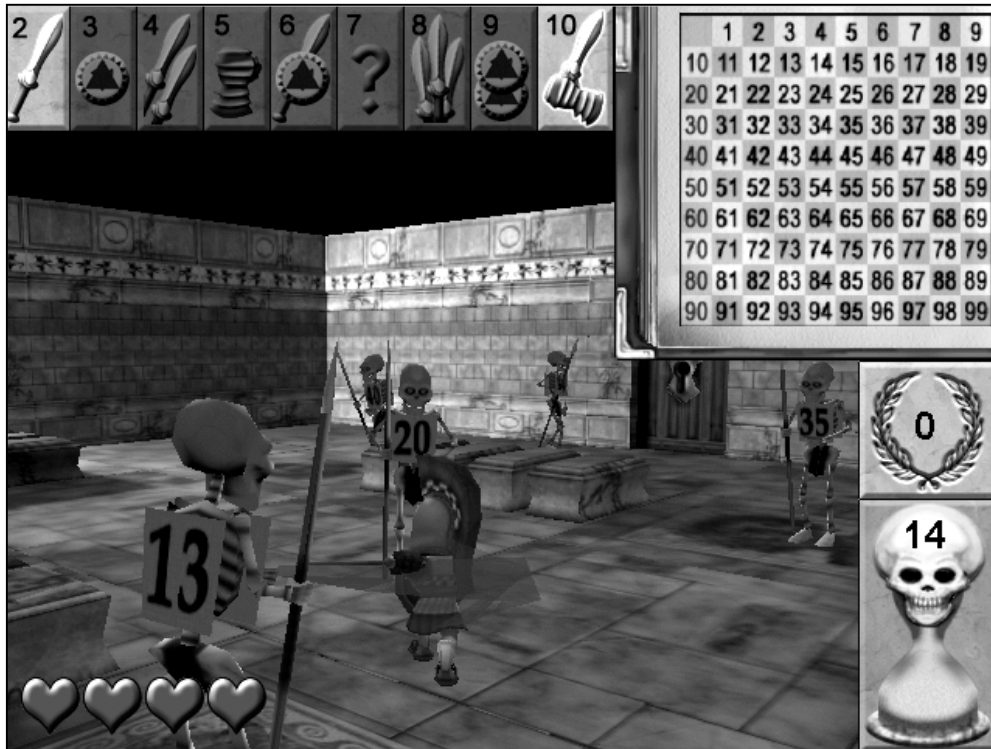
FIGURE 3. A screenshot from the intrinsic version of ZOMBIE DIVISION.